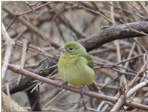
Painted Bunting – Masonville Cove