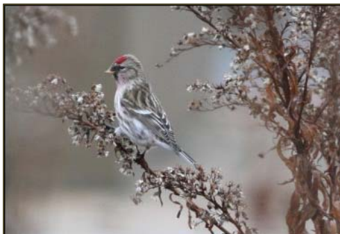
Common Redpoll – Sunset Park