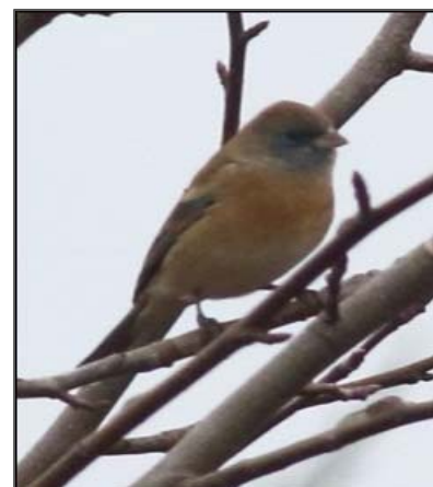
Lazuli Bunting – Berlin