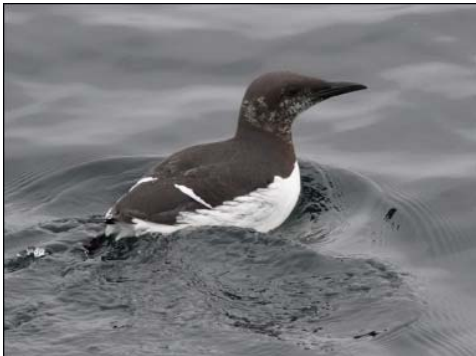
Common Murre – OC Pelagic