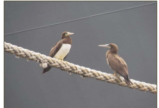
Brown Boobies – Baltimore Harbor