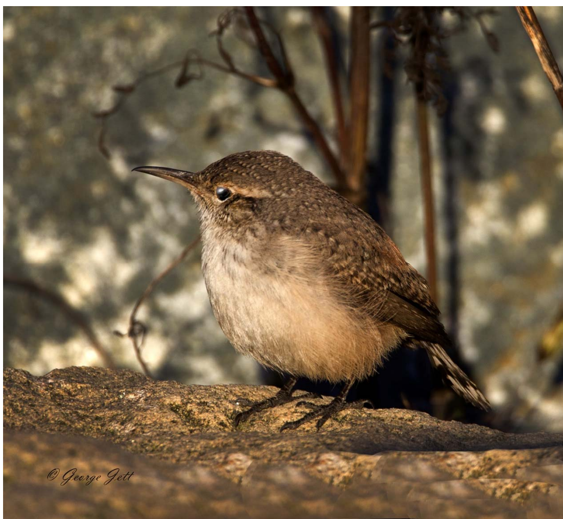
Rock Wren – Ocean City, Worcester County