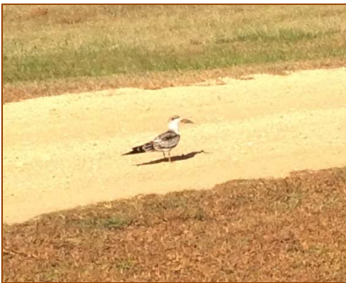
Black Skimmer – Mt. Calvert Manor