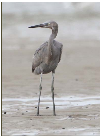
Reddish Egret – Skimmer Island